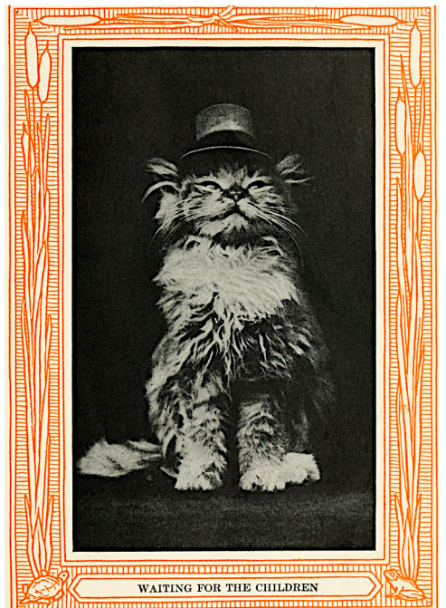
WAITING FOR THE CHILDREN

A free printable collage sheet from The Art Scavenger. More at TheArtScavenger.com