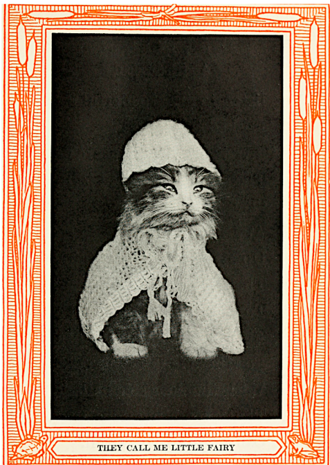
THEY CALL ME LITTLE FAIRY