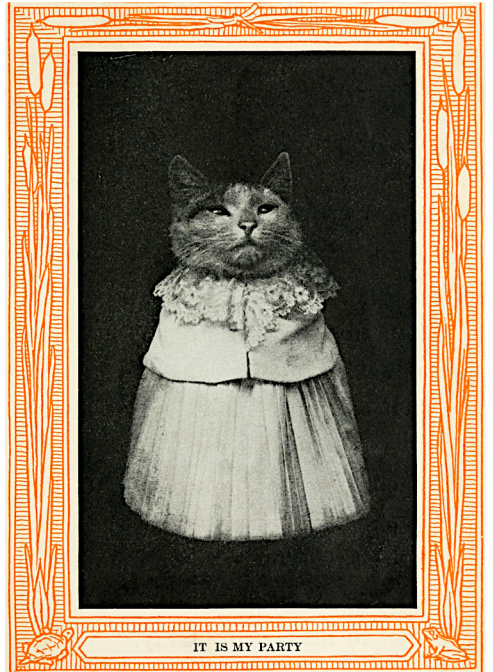
IT IS MY PARTY