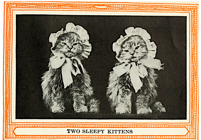
TWO SLEEPY KITTENS