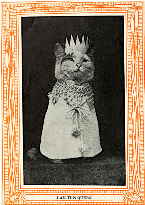
I AM THE QUEEN