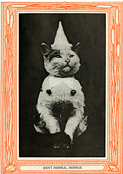
HEY! DIDDLE, DIDDLE